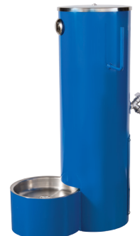
370 SM PET FOUNTAIN with HOSE BIB & HOSE HOOK