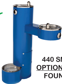
440 SM with OPTIONAL PET FOUNTAIN