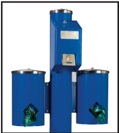
Shown with OPTIONAL Hand Sanitizer!